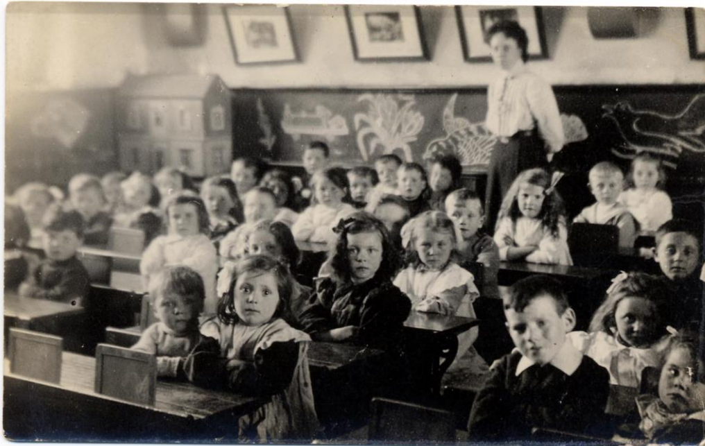
A Victorian mixed-age classroom

During the Victorian era, a network of village schools was established. The majority of their first pupils had never been to school before, and teachers in all local schools found it difficult to get children to know what was expected from them in these new circumstances. The children were spilt into Standards or groups according to their ability, rather than age. A few of the more fortunate children had possibly learnt the alphabet from a family member who could read or had perhaps learnt to read at Sunday School in chapel or church.