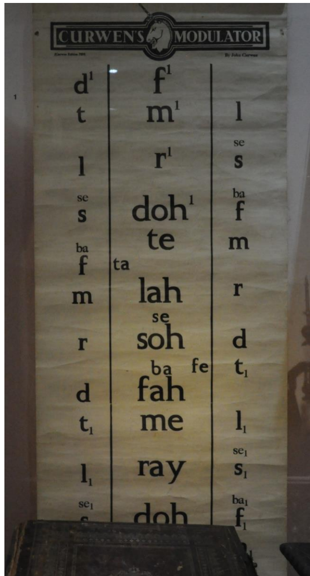
Tonic sol-fa - Modulator

Often there would be a close link with nature, gardening and farming. Music lessons included learning hymns and Tonic sol-fa