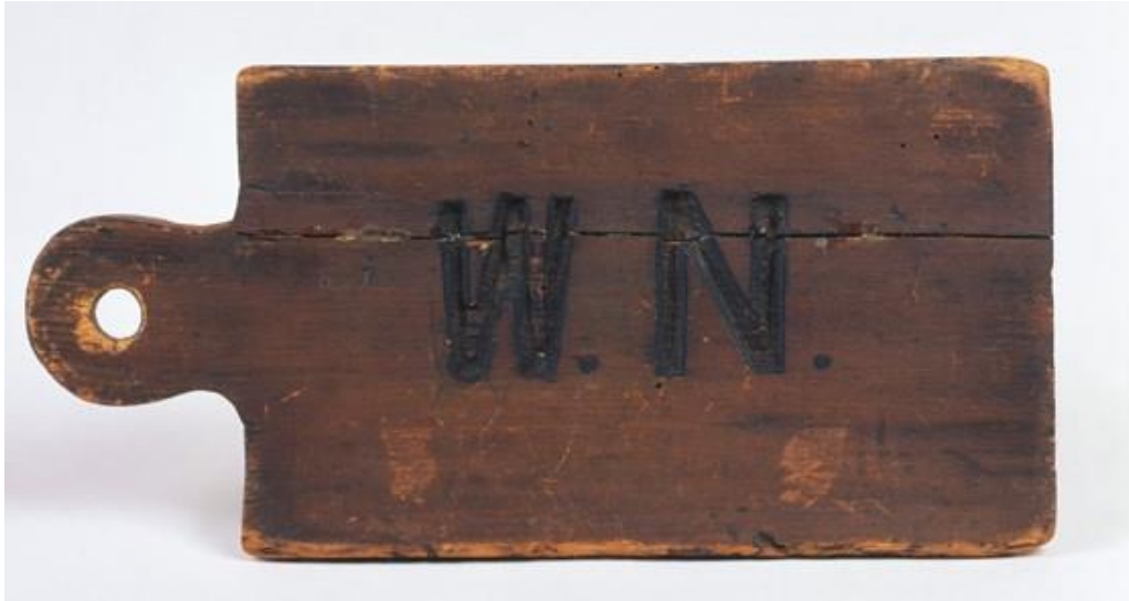
A Wooden Welsh Not

In the 1890s, children were taught through the medium of English although Welsh was their first language. The Welsh Not, or Welsh Note, was a piece of wood or slate. It had the letters W.N. or the words Welsh Not/Welsh Note on it. It was used during the 18th and 19th centuries. Children were only meant to speak English at school, therefore the Welsh Not was placed around the neck of a child who spoke Welsh.